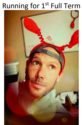
Lobster West | Owner Restaurant